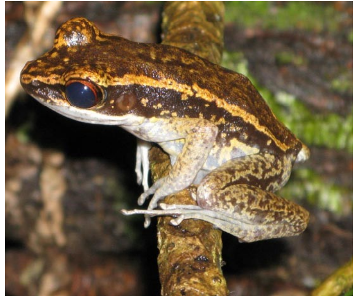
Rana similis is possibly declining at Mt. Palay-palay in the Philippines and has tested positive for Bd.

In our recent publication (Swei et al. 2011) we proposed three hypotheses to explain why Bd is not currently linked to significant amphibian declines in Asia: 1) Bd has not fully emerged in Asia, 2) Bd is endemic to Asia and shares an evolutionary history with native host species who are resistant, and 3) Bd emergence is inhibited due to abiotic or biotic conditions that are unique to Asia. We set out to evaluate these potential hypotheses by conducting the most extensive survey of Bd in Asia to date. Over the course of nearly a decade (2001-2009) our colleagues collected 3363 samples from frogs and amphibians from 15 countries in Asia, including Papua New Guinea. Most of these samples were tested using a quantitative PCR method that can determine the infection intensity on the animal measured in zoospores counts, but many samples were also tested using histology.