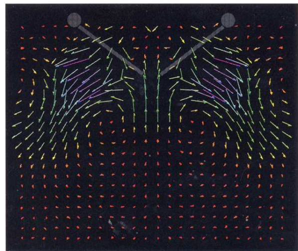
Figure 2. Diagram of the net displacement of water produced by the "fling-and-squeeze" motion of a pair of food-particle-capturing appendages (second maxillae, M2's) of the calanoid copepod Centropages velificatus (arrows indicate water direction and their color represents distance moved: blue ~ 460 \mu\text{m} , green ~ 230 \mu\text{m} , red < 1 mm). The gray bars indicate the positions of the M2's (390 \mu\text{m} long) after the fling-and-squeeze is completed, and the gray circles represent the hinges between the M2's and the body surface of the animal. We are looking down on the anterior end of a copepod that is vertical in the water; the body of the animal is at the top of the picture, the M2's are on the ventral surface, and the mouth is midway between the M2's. During the fling, the M2's rotate away from each other, and during the squeeze, they rotate back towards each other. Some copepods operate their M2's so slowly that little water flows through the array of setae (hairs) on an M2, which therefore functions like a paddle moving water containing food particles towards the mouth. In contrast, C. velificatus moves its M2's more rapidly and water flows through rather than around the array of hairs on each M2. These leaky M2's can filter particles from the water moving through them, whereas paddle-like M2's cannot. As this diagram indicates, water is drawn towards the mouth and is passed laterally through the M2's when a C. velificatus does a fling-and-squeeze. This flow visualization was made using a dynamically-scaled physical model of a pair of C. velificatus M2's attached to a body surface, and this image was produced by T. Cooper using the particle image velocimetry program described by Cowan and Monismith (1997).

the squeeze (Koehl, 1995). In contrast, other species such as Temora stylifera that have finely-meshed (Fig. 1), slowly-moving M2's whose setae operate at Re = 10^{-2} , have paddle-like M2's that capture food by drawing a parcel of water containing an alga towards the mouth